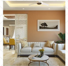
Fully Fitted Interiors