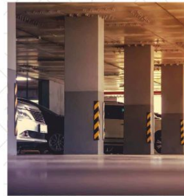
Covered Car Parking