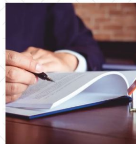
Clear Titled Document