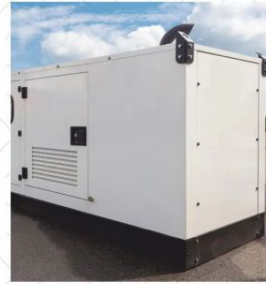
Powerbackup For Apartments