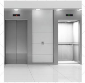
8 Passenger Lift