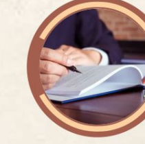
Clear Titled Document