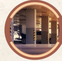
Covered Car Parking