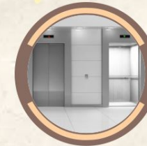
8 Passenger Lift