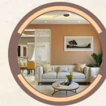
Fully Fitted Interiors