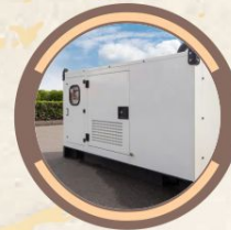
Powerback For Apartments